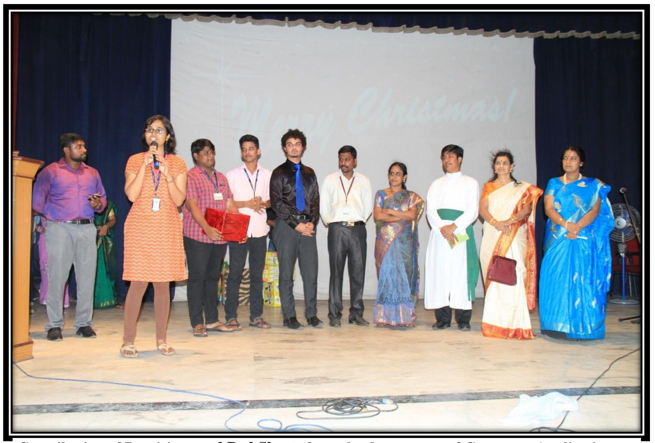
Contribution of Provisions and Bed Sheets from the department of Computer Applications to Mact India NGO

The Department of Computer Application celebrated the Christmas Program along with Mact India, an organization which works for development of women and children in villages. The students collected Stationery materials, Provisions and Bed Sheets and distributed to the villagers.