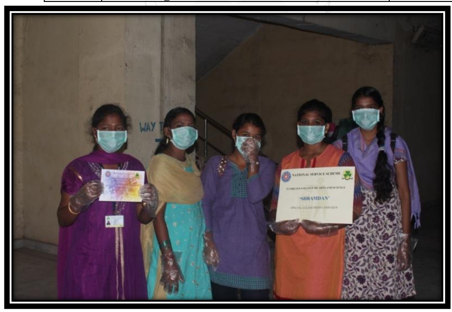
Awareness Programme "Shramdan" at Kotturpuram Railway Station