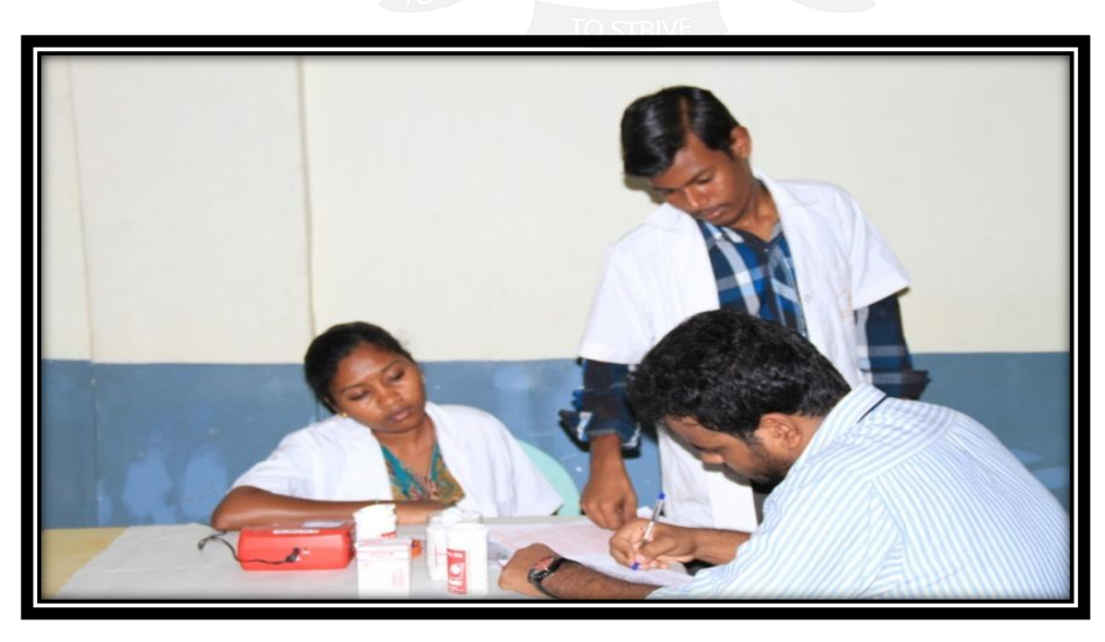
Medical Camp on 21st December 2014 at Kolathur