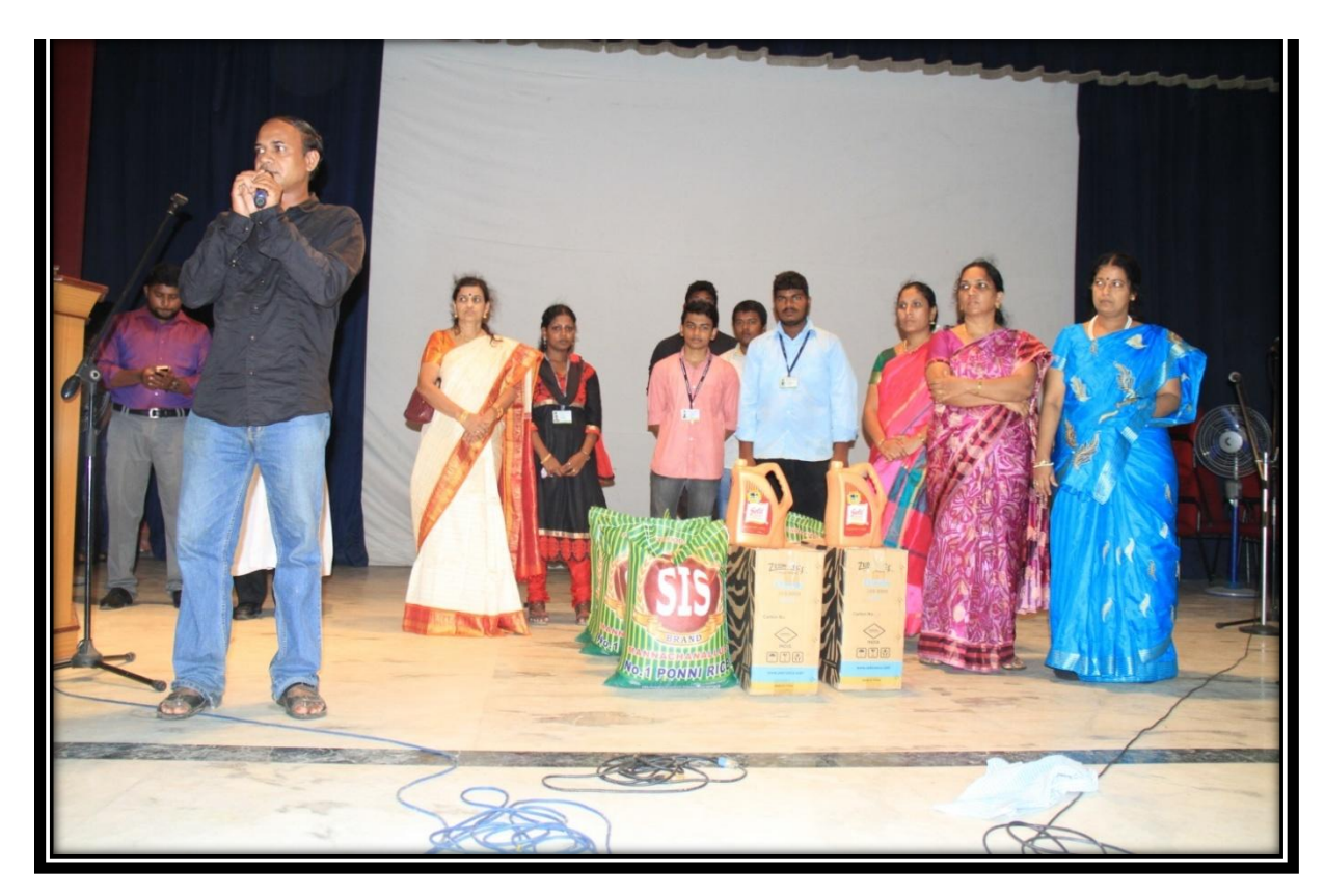
Staff and students from the department of Commerce along with a representative from the NGO, SIRAGUGAL

Along with academic pursuits it is important to inculcate social responsibilities and values in the impressionable mind of a student. An ideal opportunity was provided during the Christmas 'Care and Share' program where each department adopted an NGO. Students voluntarily came forward in raising funds for the purpose. Siragugal , an NGO from Besant Nagar, Chennai, was gifted with an amount of Rs. 38,000, (cash and kind), by the Department. We are proud to state that this was the highest amount given as part of the Christmas Outreach program.