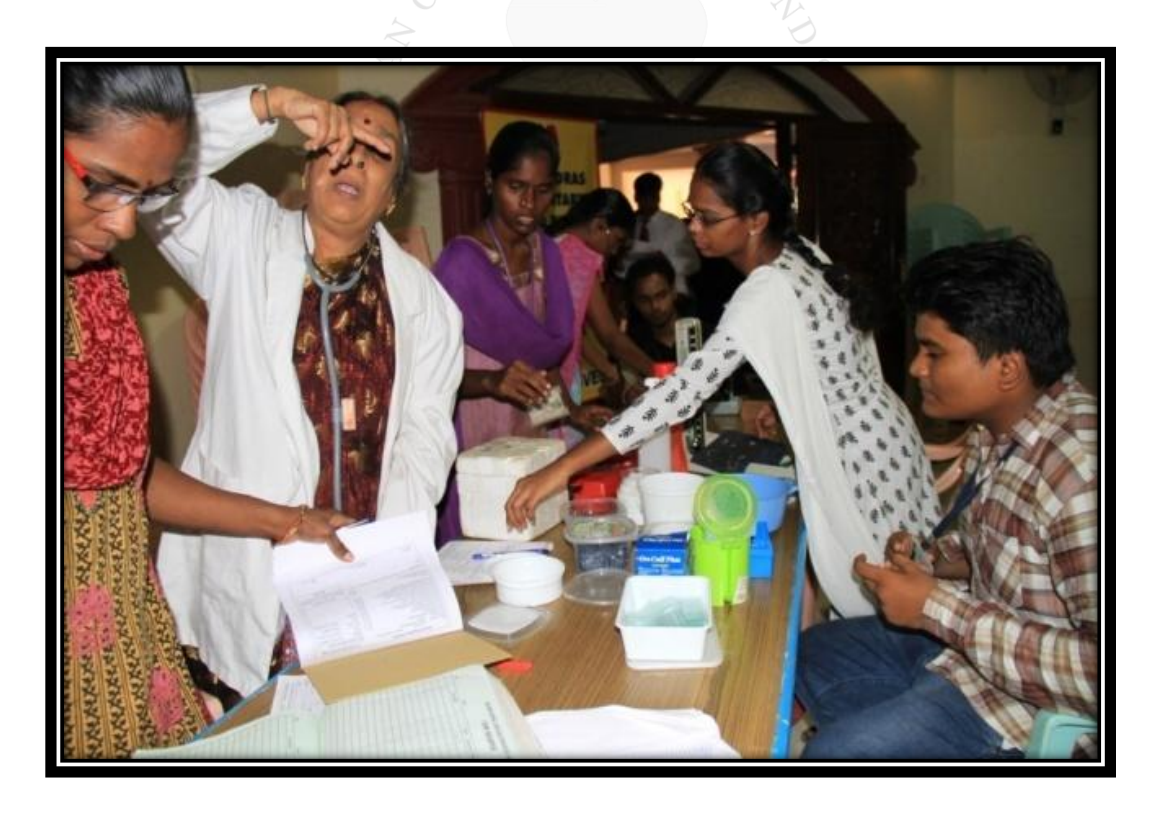
On 26/01/2014 Eye Donation Camp at Patrician College