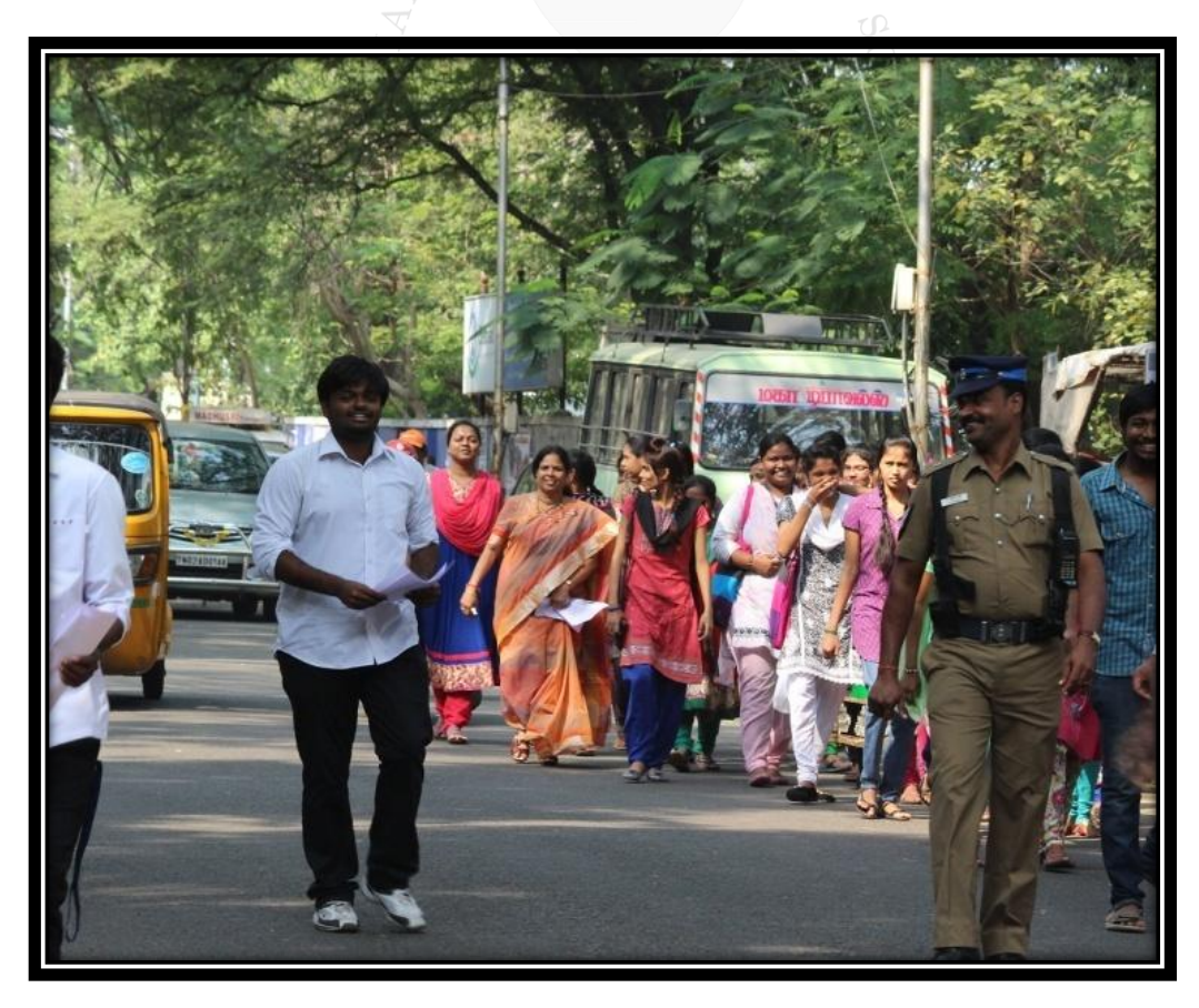
On 17th January 2015 Road Safety rally to create awareness on road safety at Kotturpuram