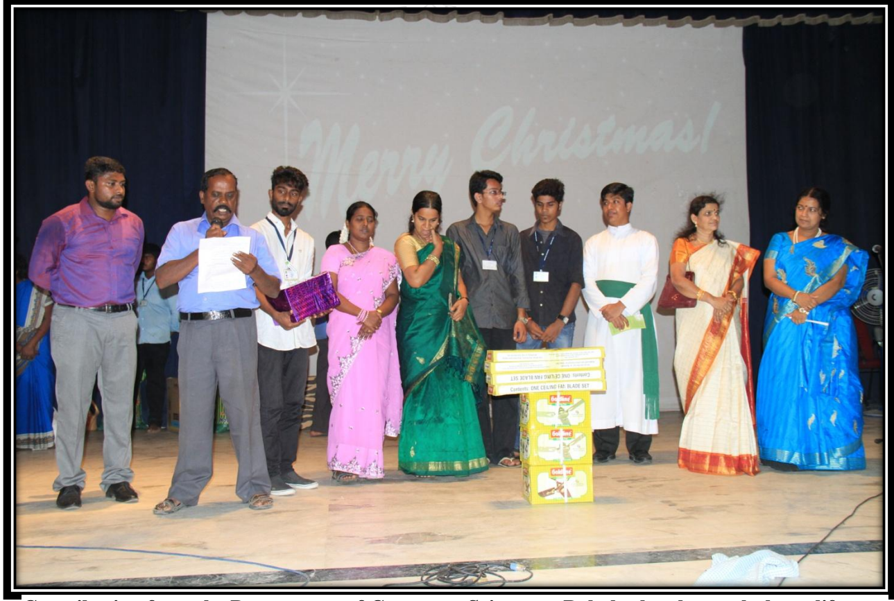
Contribution from the Department of Computer Science to Rehaboth, who work the upliftment of women

Giving back to society is part and parcel of the learning process. The Christmas 'Care and Share' program was ideal platform to serve the community. On 17 December 2014 the department gifted four fans to Rehaboth organization for women. The silent sentinel, the college watchman was gifted with clothes by the students to mark their gratitude for his tireless work.