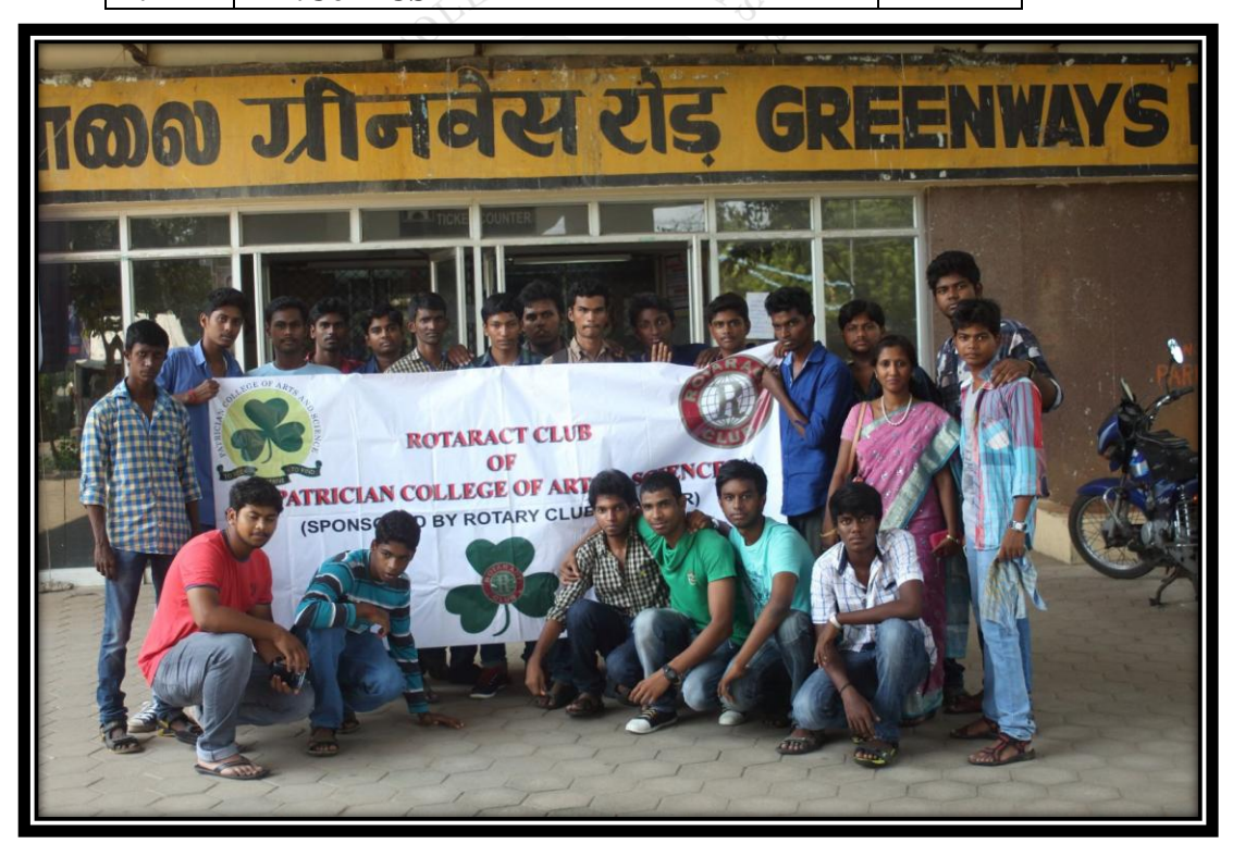
2 October, 2014 Cleanliness Awareness Programme at Greenways Road Railway Station