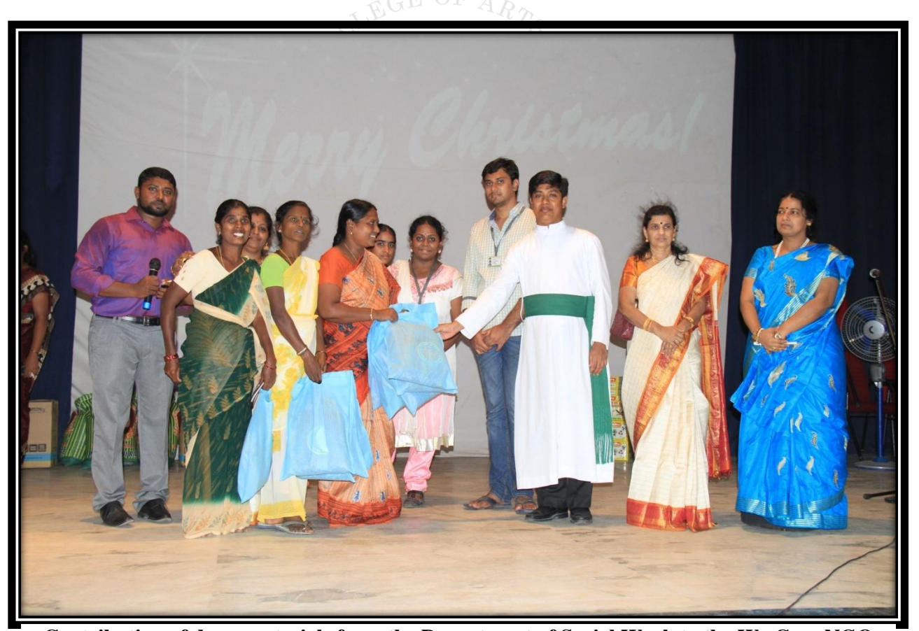
Contribution of dress materials from the Department of Social Work to the We Care NGO

The Department of Social Work celebrated its Christmas Program along with We Care , a Tribal welfare organization with particular care on Irular Community. The Students of Social work collected the dress materials and distributed to the people of Irular Tribe.